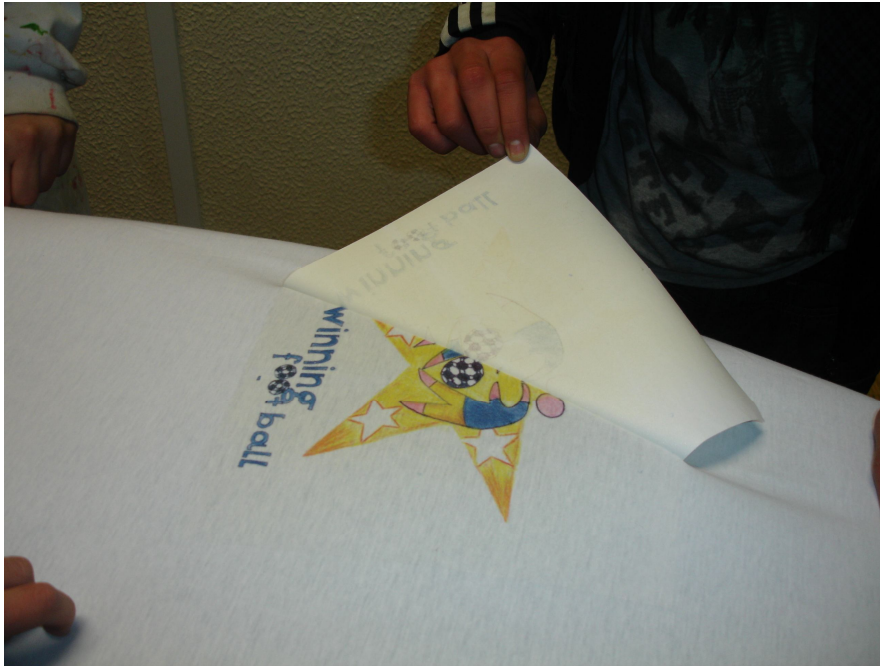
(Portuguese pupil doing iron on transfer)